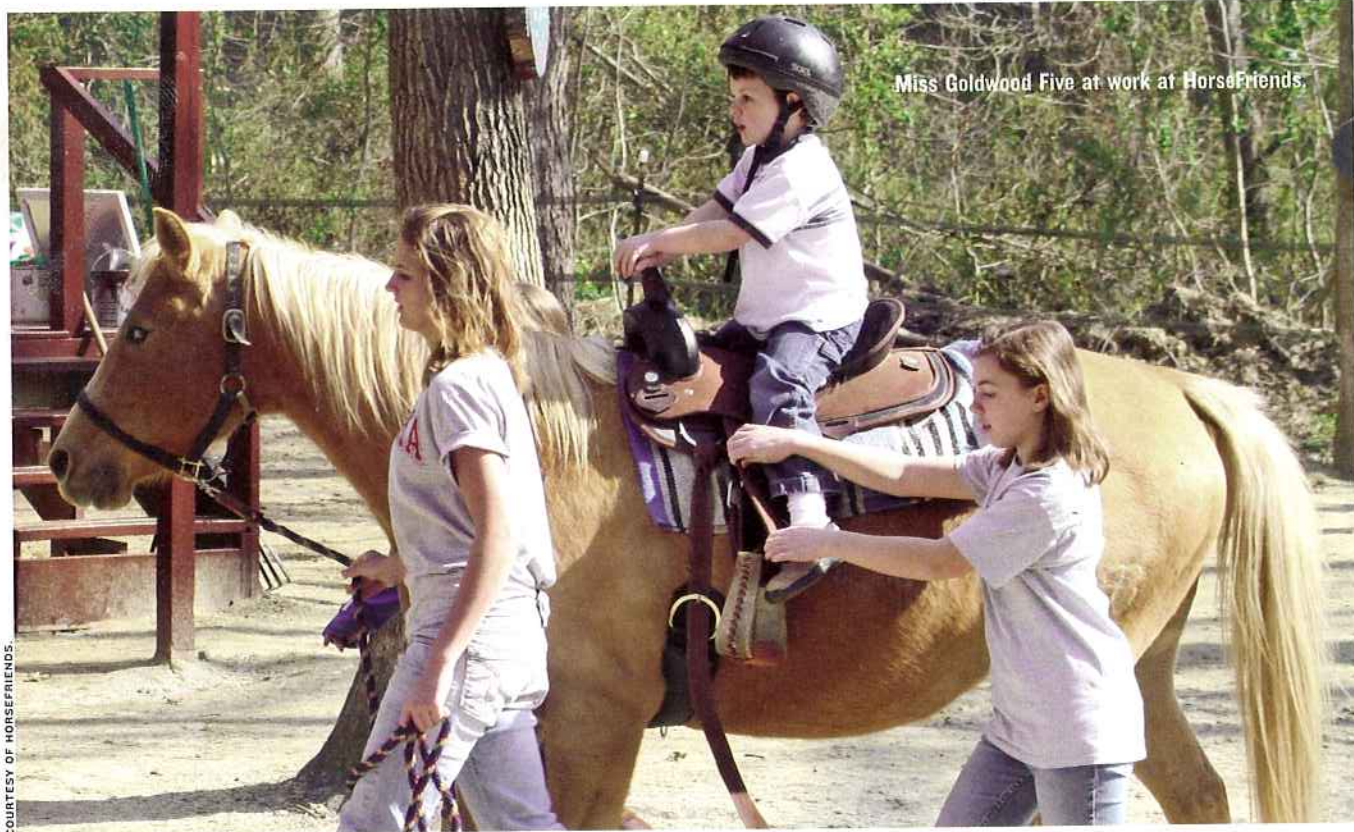
Miss Goldwood Five at work at HorseFriends.